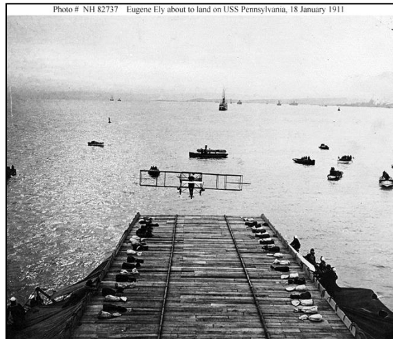
Photo # NH 82737 Eugene Ely about to land on USS Pennsylvania, 18 January 1911

15 Jan 1914 The Signal Corps Aviation School issued the first Army aviation safety regulation . It required pilots to wear helmets and leather coats for overland flights, and unsinkable coats for over-water flights.