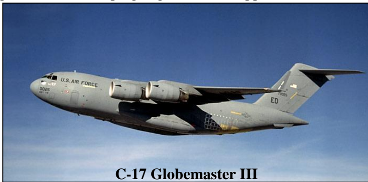
C-17 Globemaster III

16 Jan 1998 Humanitarian airlift to China. After a devastating earthquake hit China's Northern Hebei Province, a USAF C-17 left Kadena AB, Japan, for Beijing with 40 tons of relief supplies, consisting of blankets, sleeping bags, medical supplies, rations, and cold-weather clothing.